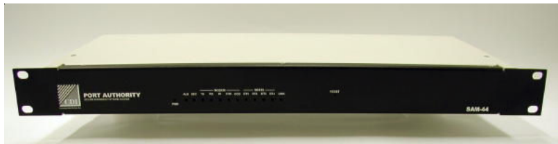
Port Authority Port SAM-44 (4 PortPort)