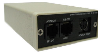
Port Authority SAM-11 (1 Port)